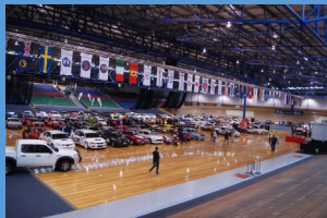
Entries at the Start of TAGA Tasmania 2017