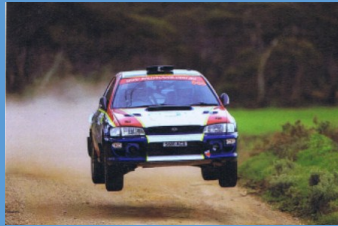
Robertstown Car Rally