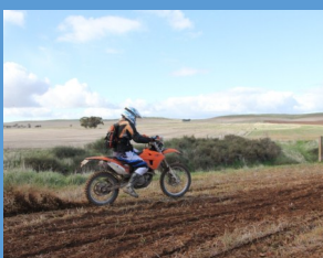
12 Hr. Motor Cycle Trial